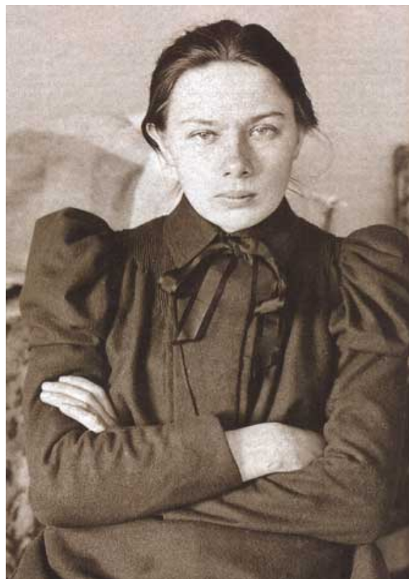
Nadezhda Krupskaya, Deputy Education Commissar, CC CPSU member, Supreme Soviet member, wife of V I Lenin, photographed in 1890:

The proletariat cannot achieve complete freedom, unless it achieves complete freedom for women.